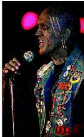
Lucky Diamond Rich